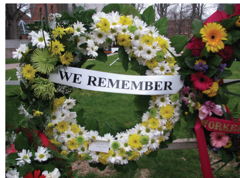
Day of Mourning April 28

Increasing health and safety education for workers and employers is also key in the battle to reduce workplace injury. In 2010 WCB ramped up their delivery of safety workshops by making 208 presentations (an increase from 152 sessions in 2009). Topics included workplace inspections, investigating incidents and injuries, safety for managers and supervisors, OHS programs, and health and safety representatives.