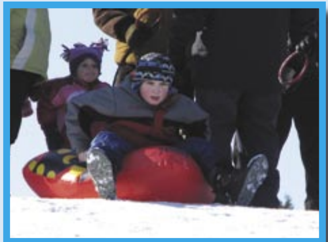
PEI UPSE members and their families enjoy tubing at Mill River during Family Fun Day!

Please listen to the radio in case of a storm cancellation.