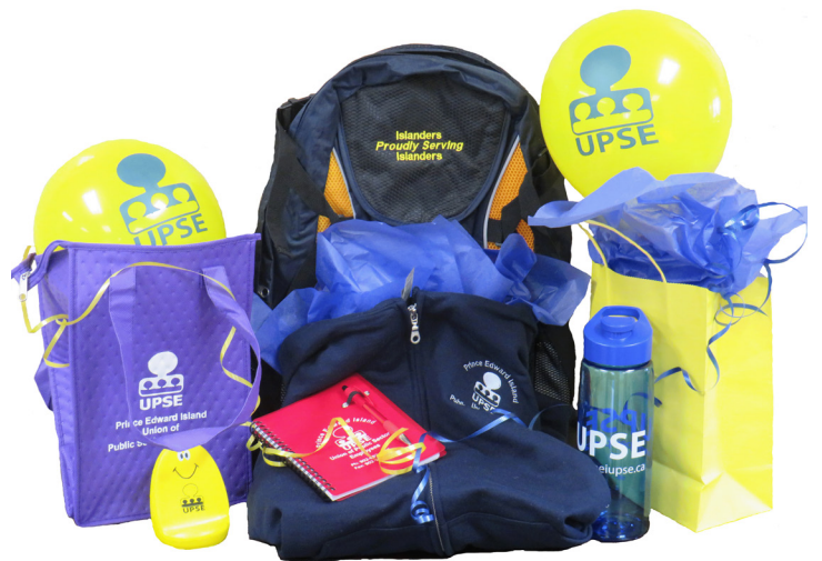
Prizes may not be exactly as shown in picture

Please ensure there are no identifiers in your picture, e.g., clients, patients, members of public, documents, etc.